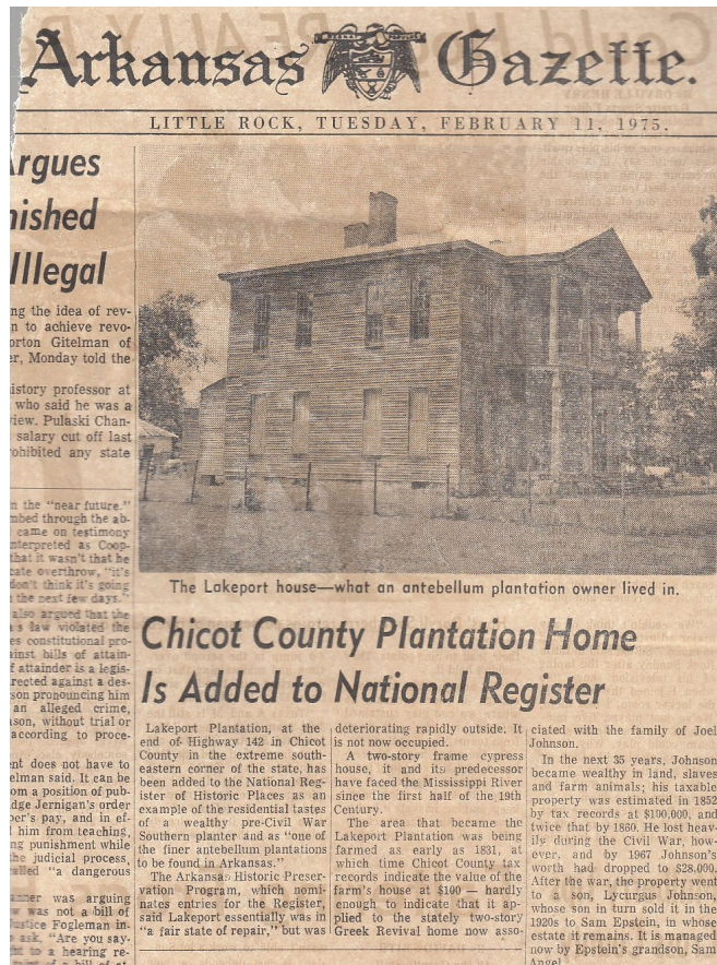
"Chicot County Plantation Home Is Added to National Register" February 11, 1975. Arkansas Gazette. 2015.002.0029 MOCCA Collection Lakeport Plantation.